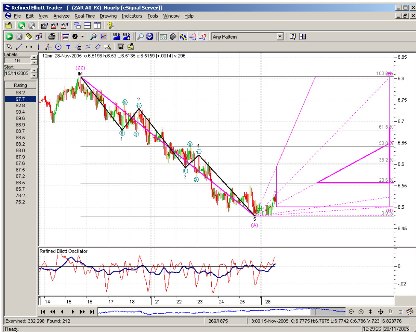
Chart 2. Move from September showing incomplete 2 nd wave

An unlikely break above 6.8037 would indicate this downward correction is complete.